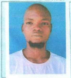
PHOTOGRAPH OF SEAFARER

A handwritten signature in black ink, appearing to be 'RMB'.