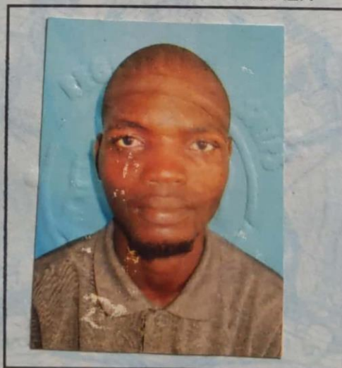
PHOTOGRAPH OF SEAFARER