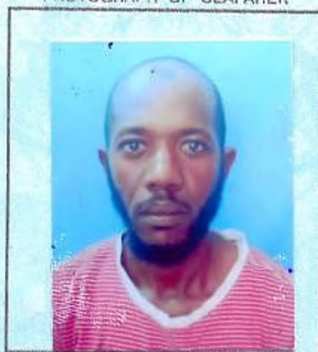
PHOTOGRAPH OF SEAFARER