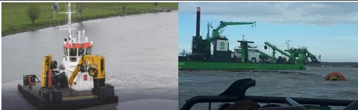
Company: ORCA crew Services B.V